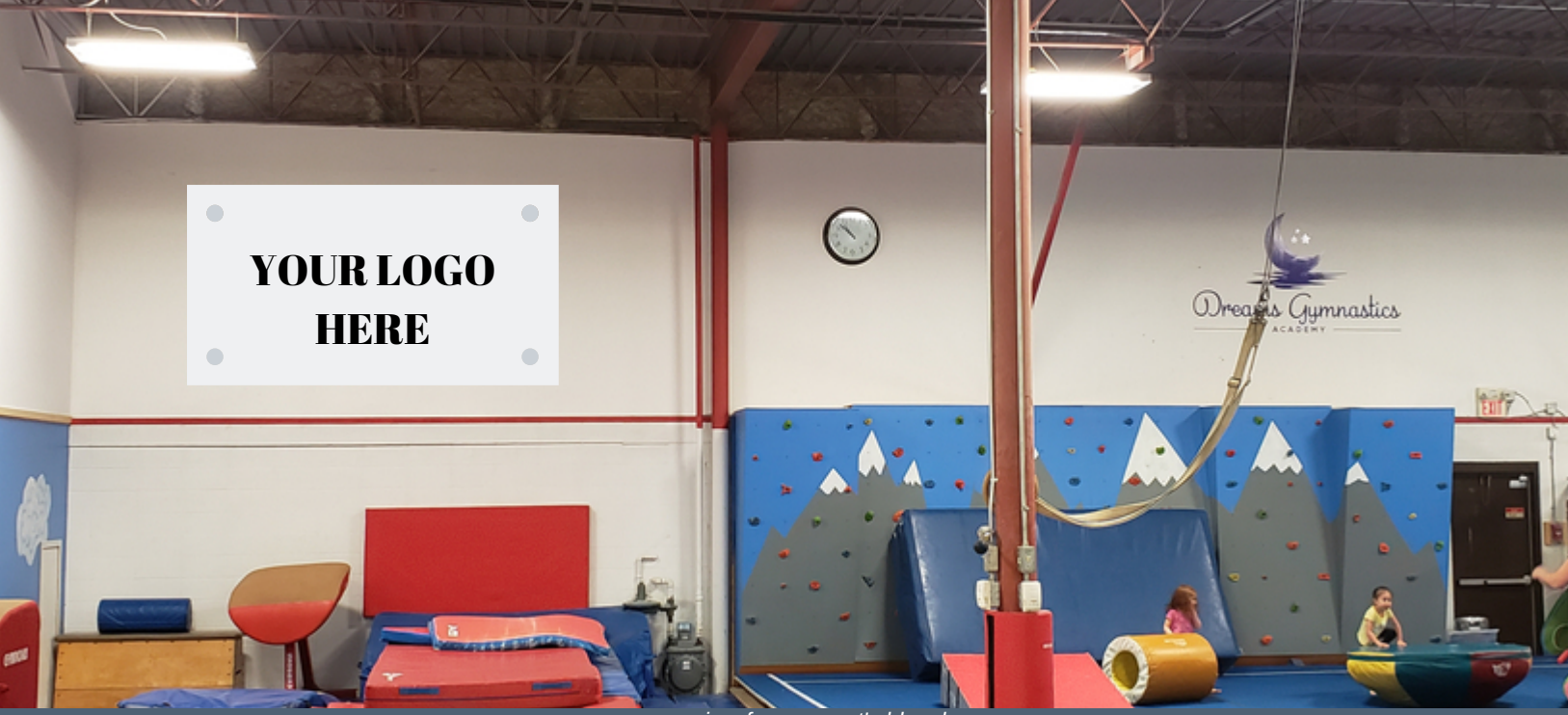
• view from parent's bleacher